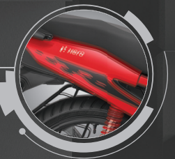
DUAL TONE BODY GRAPHICS