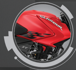
MUSCULAR FUEL TANK