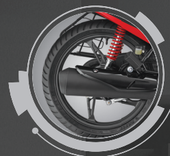
100/80 WIDE REAR TYRE