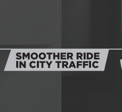
SMOOTHER RIDE IN CITY TRAFFIC