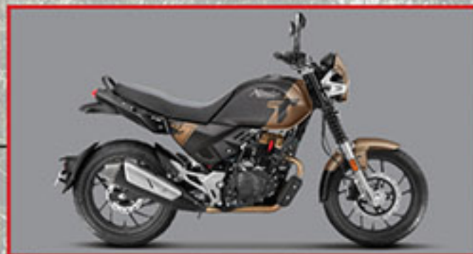
MATTE SHIELD GOLD