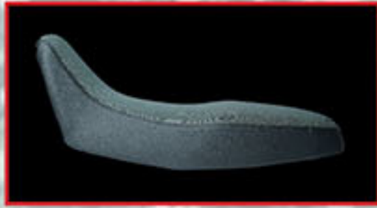
MODERN SEAT COVER