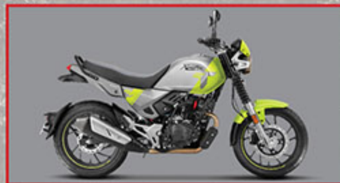
FUNK LIME YELLOW