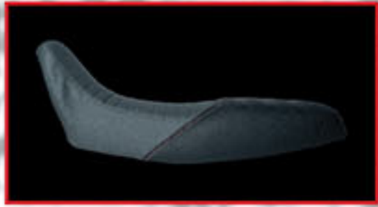
DUAL TONE SEAT COVER