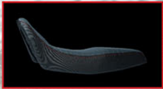
TOURER SEAT COVER