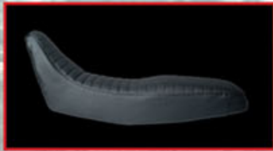
ADVENTURE SEAT COVER